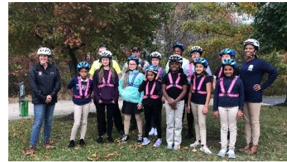
Existing programs such as the City of Lorain Girls in Gear program and the GO LORAIN bike share will be enhanced with the new multi-use path along E. 36th